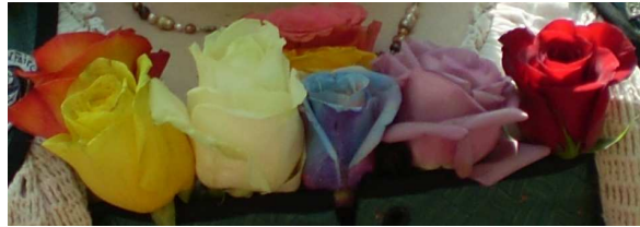
From the furthest reaches of the Khilgard Hills on Cottman IV or the fringes of the Pelegir Forests

Square Shawl knit in the round Suggested Needle 4.5 to 5 mm Suggested Yarn - Fingering weight approx. 1700 yards